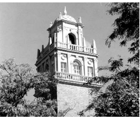
Baird Memorial Carillon, Texas Tech University

With an addition of a low E flat and six trebles (Meeks and Watson), the instrument is now 43 bells, still transposing up a seventh. The clavier is Meeks and Watson and a full four octave practice instrument now resides in the basement of the Music Building on the campus.