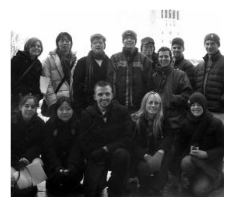
University of Michigan visit to Christ Church, Cranbrook

The U-M carillon students come from academic backgrounds including music performance, aerospace engineering, movement science, computer engineering, philosophy, musical theater and biomedical engineering.