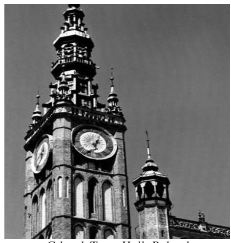
Gdansk Town Hall, Poland

The city has a stirring history. The shelling of the Westerplatte peninsula on September 1, 1939 initiated World War II. Five years later the old city center was almost completely destroyed. Anyone wishing to know more about the city can find much information at www.gdansk.pl.