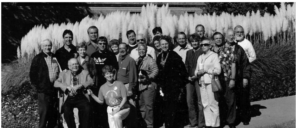
Gathering of the Texas Regional, 2005