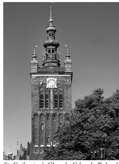
St. Catharine's Church, Gdansk, Poland

Relatively new to the carillon or thinking of attending your first GCNA Congress? You don't have to be a virtuoso to benefit from attending the Congress this summer. See Carillon Coaching Workshops, page 5.