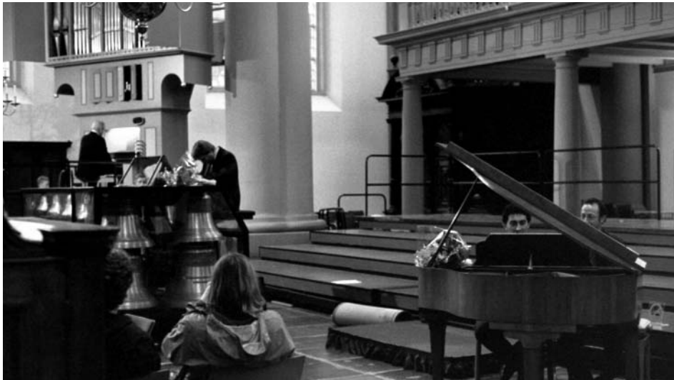
Westerkerk, Amsterdam, 2005 Eurocarillon Festival