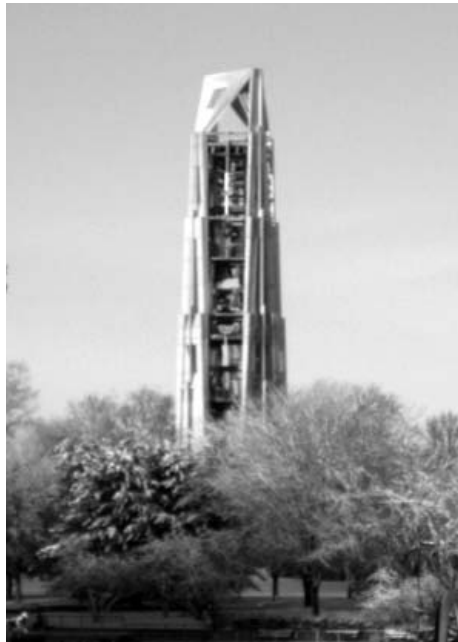
Millennium Carillon, Naperville

While it was always assumed that the tower and instrument would eventually become a property of the city, the private group planned to raise the completion funds before the turnover. The Naperville City Council has decided that the city will assume title to the tower and instrument immediately, which will guarantee its completion and opening to the public. The Foundation has offered to continue its fund-raising efforts.