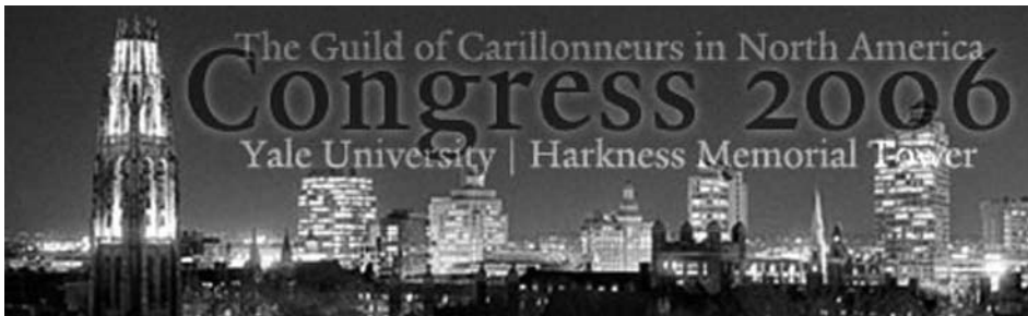
At left, Yale Memorial Carillon