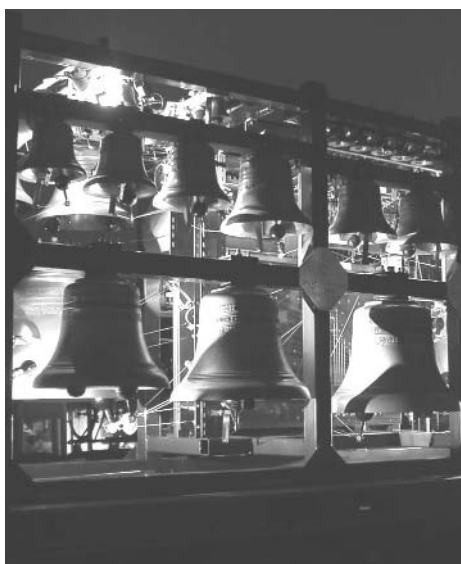
Knokke, Belgium (at night), 2005

You can also visit the official website at www.carillon.cz for sound samples, technical data, schedule and pictures.