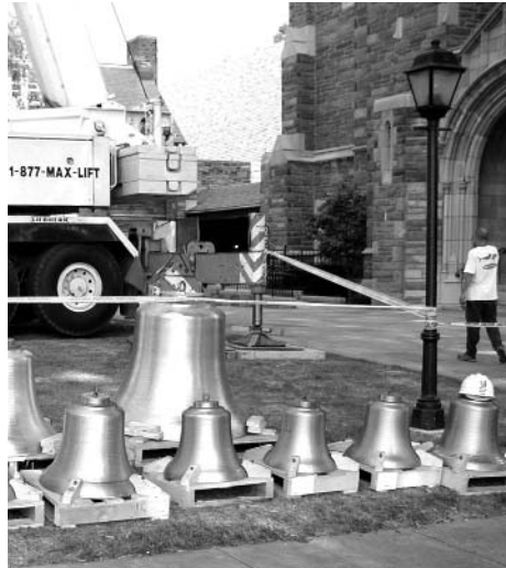
Bells await hoisting into the Bryn Mawr Presbyterian Church tower. Below, the completed carillon.