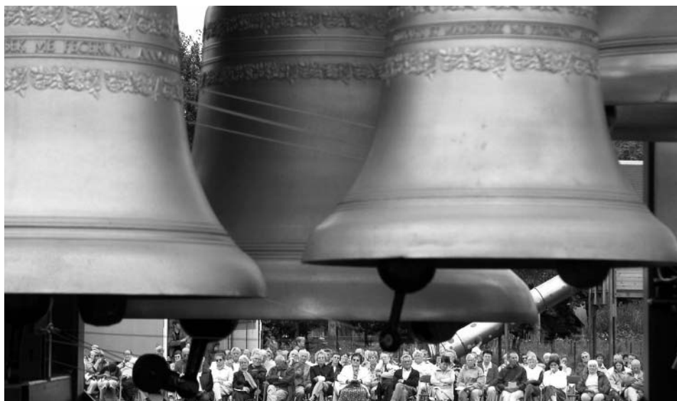
Deinze, Belgium, 2005