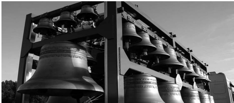
Deinze, Belgium, 2005

The Traveling Carillon of Prague is the only traveling carillon in Eastern Europe and one of the largest in the world. It was constructed for the Eurocarillon Festival held in Prague, September 2001. Since then it has appeared in cities all over Europe and has participated in the most recent Eurocarillon Festival in Holland, August 2005.