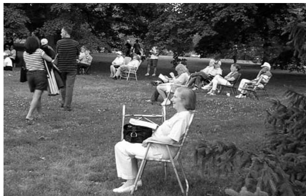
Above, attendees of the Midwest Regional Conference. Left, audience members enjoy an evening concert at the Springfield International Festival