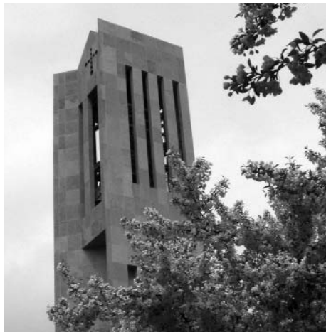
St. Hugo of the Hills