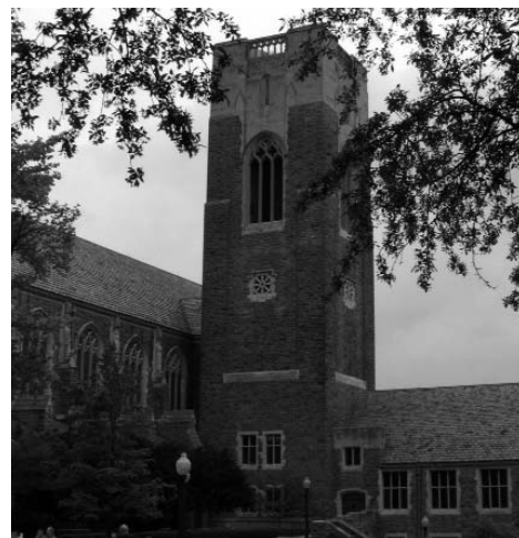
Christ Church Cranbrook