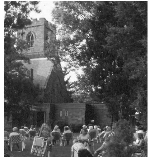
A summer evening recital audience at St. Thomas. (c. 1983)

We would all do well to emulate her example.