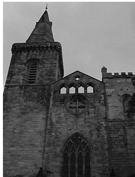
Dunfermline Abbey Church, Scotland