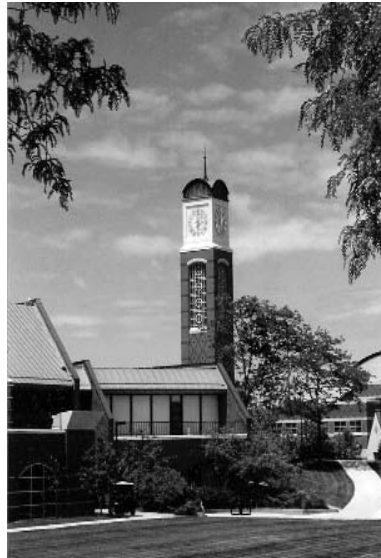
Cook Carillon at GVSU