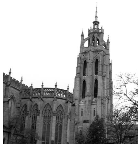
Kirk in the Hill