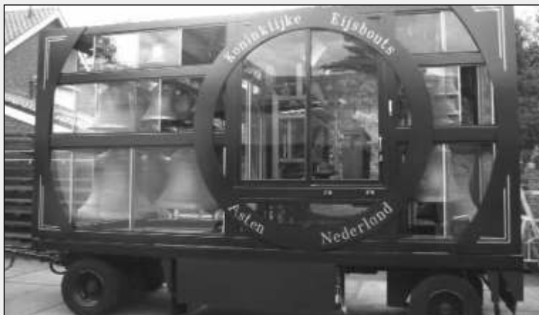
Chime Master—Eijsbouts Mobile Millennium Carillon