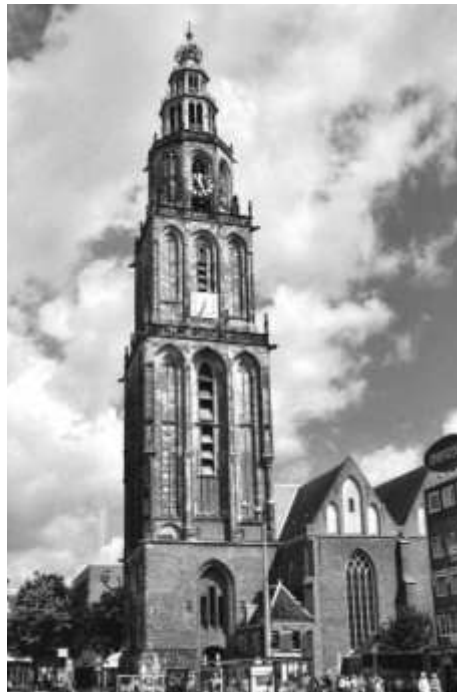
Martini Tower of Groningen

The 16th World Carillon Federation Congress will be held from Sunday, July 13, until Thursday, July 17, in Groningen, Netherlands. Based on the congress theme, "Theme with variations," a diversified program has been developed by the Stichting Carillon Congress Groningen 2008 in cooperation with the board of the Nederlandse Klokkenspel-Vereniging. In addition to the historic Hemony carillon in