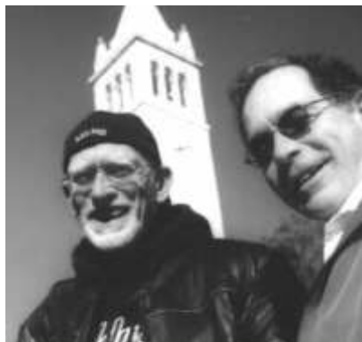
Who are these guys?