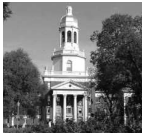
McLane Carillon at Baylor University

The 16th annual Texas Regional Carillon Conference will meet at Baylor University in Waco, Tex., on October 17 and 18, 2008. We have openings for guest recitals on the 48-bell McLane Carillon, and we invite proposals for a lecture/presentation at the conference.