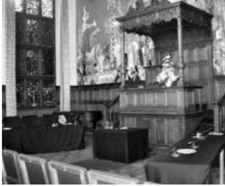
Above: Academy Building meeting room Right: Bell foundry Museum, Heiligerlee

Sixteen lectures on very different subjects will be given in the following categories: campanology, musicology, education, history and organization. Besides these topics, there will be introductions on two aspects of carillon culture as to the beginning of a possible WCF standard on carillon education and carillon construction. The location for most of the meetings