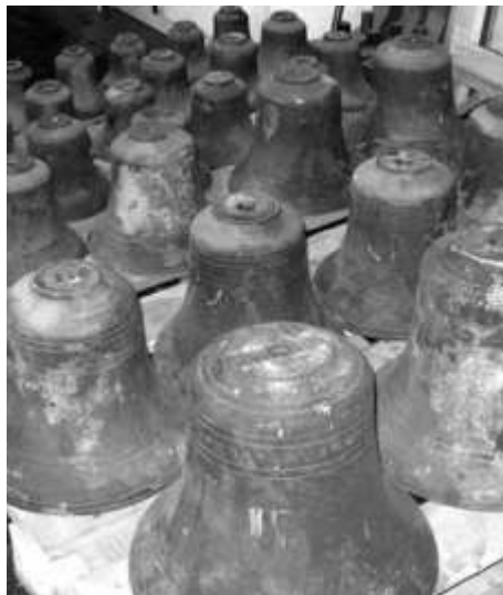
Rockefeller bells await restoration.

frame, designed so that the smallest bells reside at the top of the frame, thus allowing these higher-frequency bells to have "line of sight" to the ground, making them more audible. In addition, care has been taken to ensure that for the majority of listeners, the larger bells do not acoustically block the smaller bells.