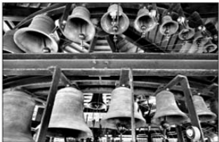
Подвеска колоколов на башне «Бокс», Лейк-Уэйкс, Флорида

Карильон – музыкальный инструмент, расположенный под открытым небом и состоящий, по меньшей мере, из 23 бронзовых колоколов (карильон в Миддлберийском колледже состоит из 48). Колокола карильона настроены хроматически. Карильонист, человек, который играет на карильоне, при игре ударяет кулаками по клавишам-рычагам, которые соответствуют белым и черным клавишам на фортепиано, а также использует педали для управления большими колоколами. Инструмент был изобретен одновременно в Бельгии и Германии в 1510 году. Начиная с 16 века и по сей день, на карильоне исполняют оригинальные произведения и обработки классической, а также популярной и народной музыки. В мире насчитывается более 650 карильонов, которые расположены в зданиях муниципалитетов, церквях, колледжах, парках и т.д.