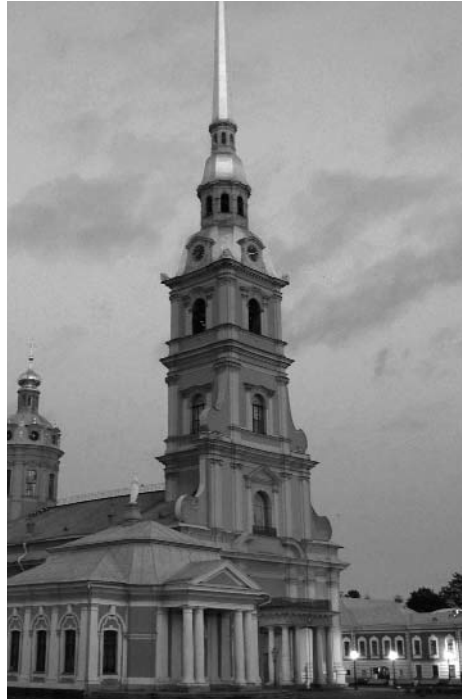
Sts. Peter and Paul Cathedral

We celebrated our Jubilee on September 16 together with individuals who invested in the creation of the instrument. Nearly 70 of the instrument's sponsors gathered in St. Petersburg to wish the carillon a happy birthday. Those who were carillonneurs got to play our carillon. And everyone agreed that the instrument is of the highest quality and sounds wonderful. The next day, the guests visited the second new instrument in Russia, the carillon in Peterhof, the