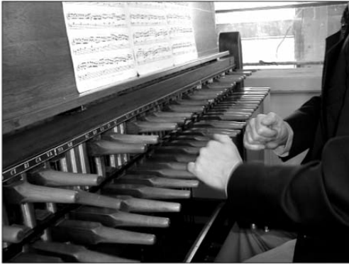
Карильонная клавиатура Национального карильона, Вальм-Фодда, Пенсильвания

in Russian. They are placed on music racks outside the chapel during the recitals and have done much to popularize the instrument. We also have posters in Chinese, French, German, and Spanish—and one in English, but no one is permitted to look at that during the summer program. By next summer, we hope to have posters in the remaining languages: Arabic, Hebrew, Italian, Japanese, and Portuguese.