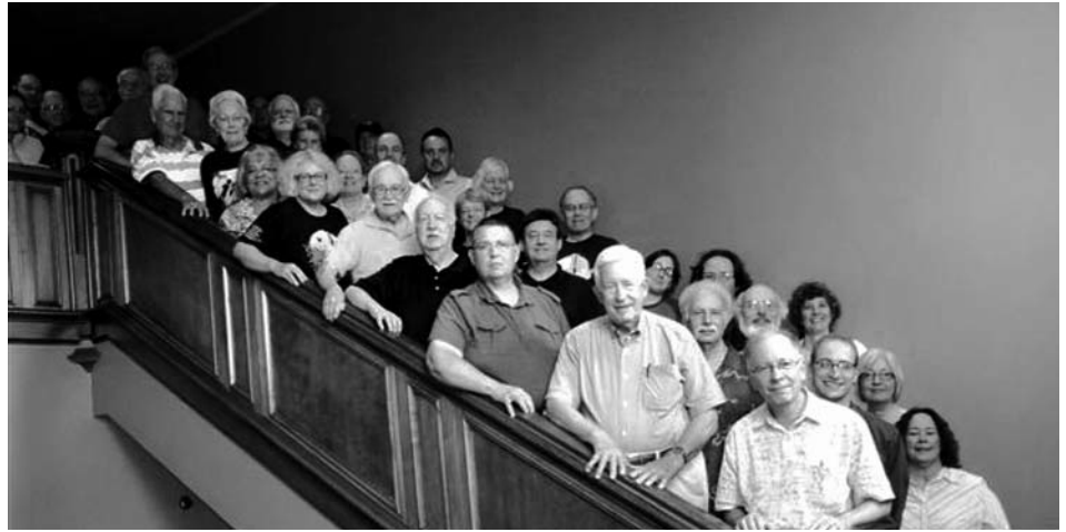
Midwest Regional Attendees