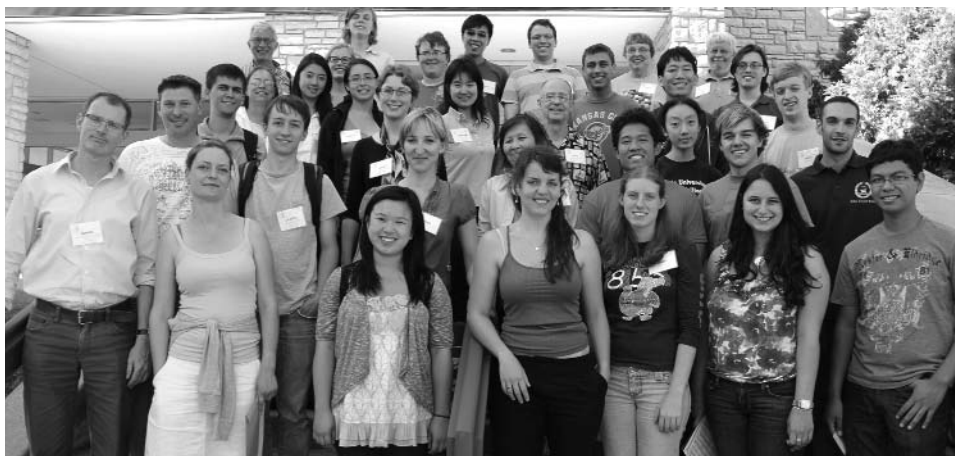
First-time Congress Attendees

At the joint gathering of the GCNA and the World Carillon Federation Congress, 50 new attendees from across the world experienced the recitals, lectures, and social gatherings. The members exhibited great hospitality in welcoming them to the Congress. Once again, thank you to GCNA publications and ACME for providing gift certificates for the first timers. Our goal is to encourage them to return and contribute to the mission of advancing the art of the carillon.