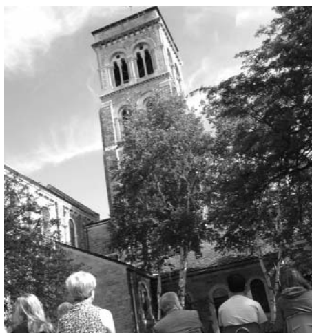
St. Mary’s of Redford Church