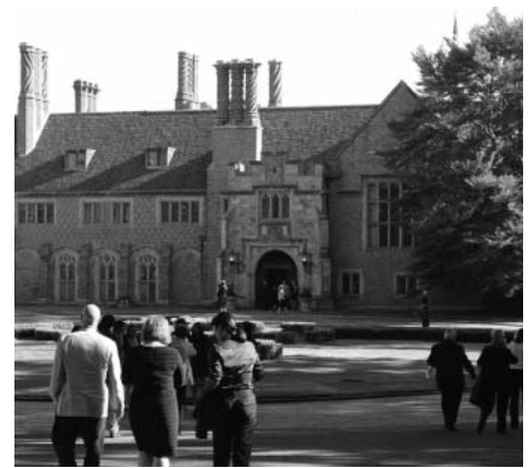
Meadow Brook Hall