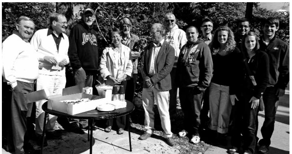
Iowa State University Carillon Festival Attendees